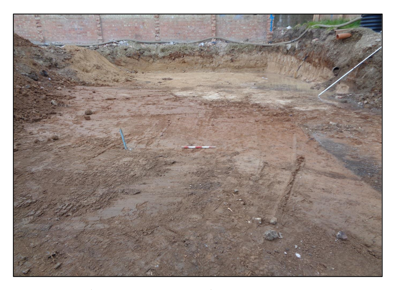
Plate 9. General View of Area 3 showing comparative lack of disturbance.