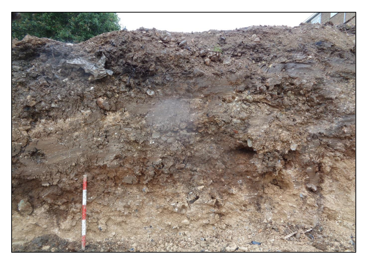
Plate 7. Area 2 Section 10 (looking North)