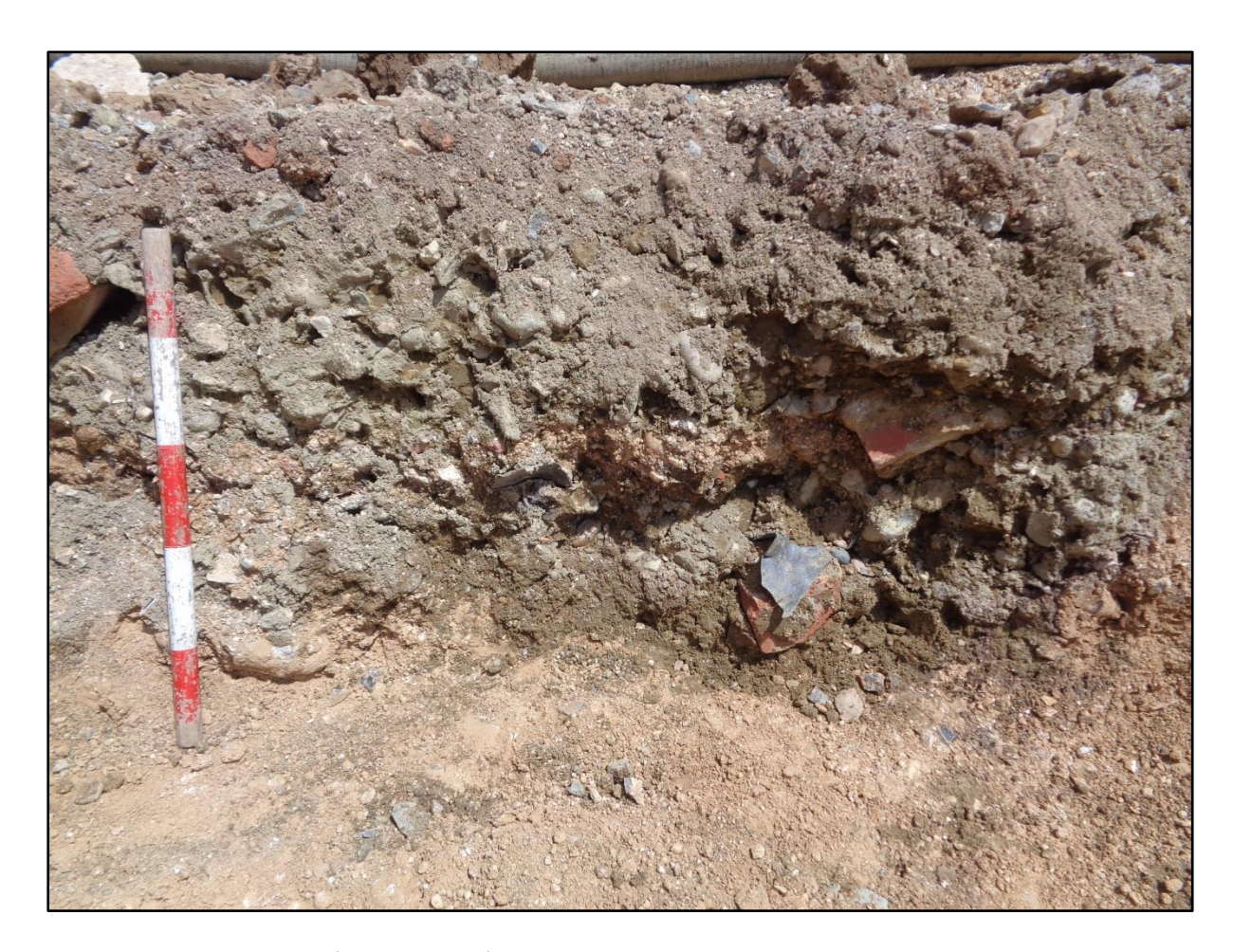
Plate 10. Area 3, Section 15 (Looking North)