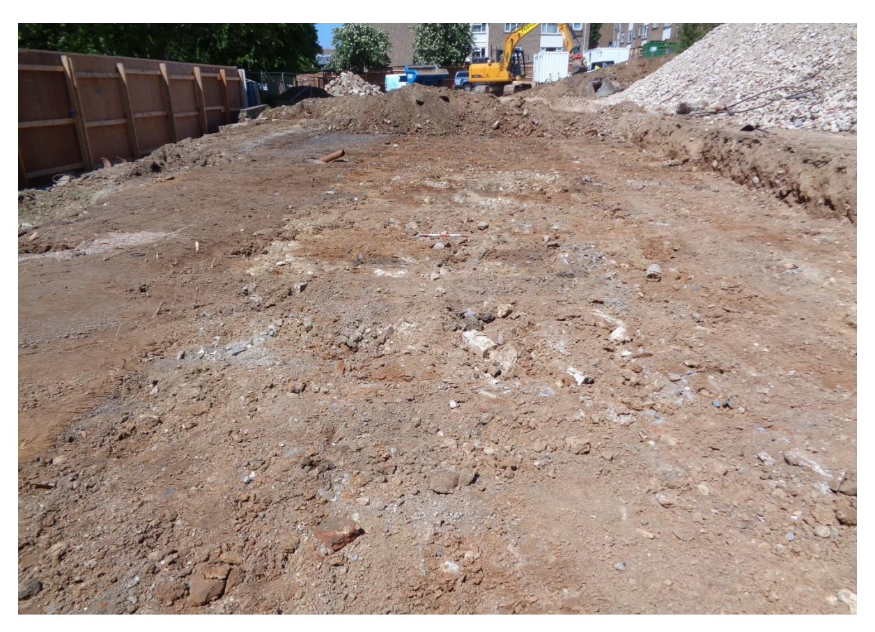
Plate 6. Subsoil strip Area 2