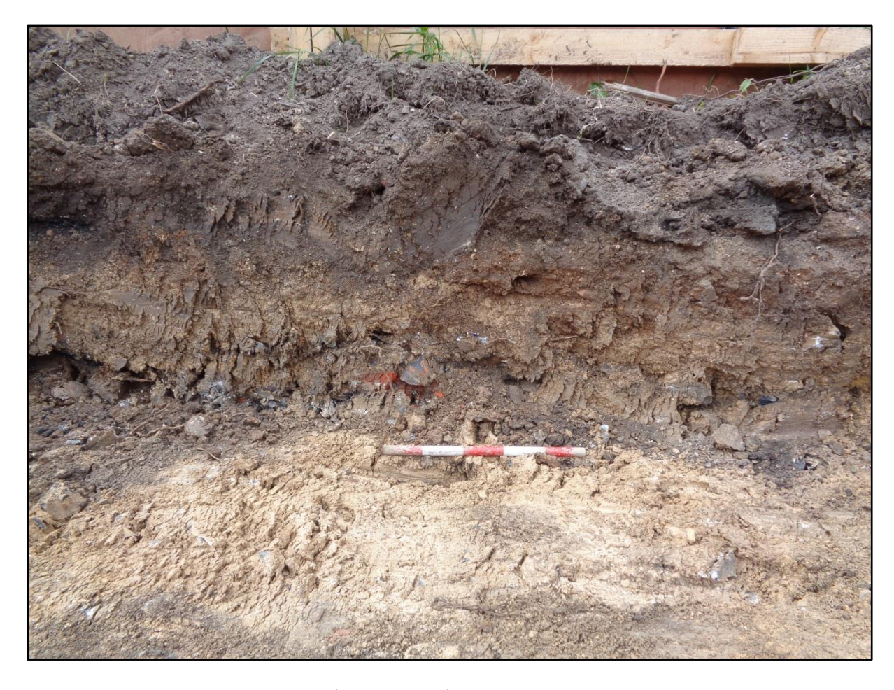
Plate 5. Section 5 across the rubbish pit. (Looking South)