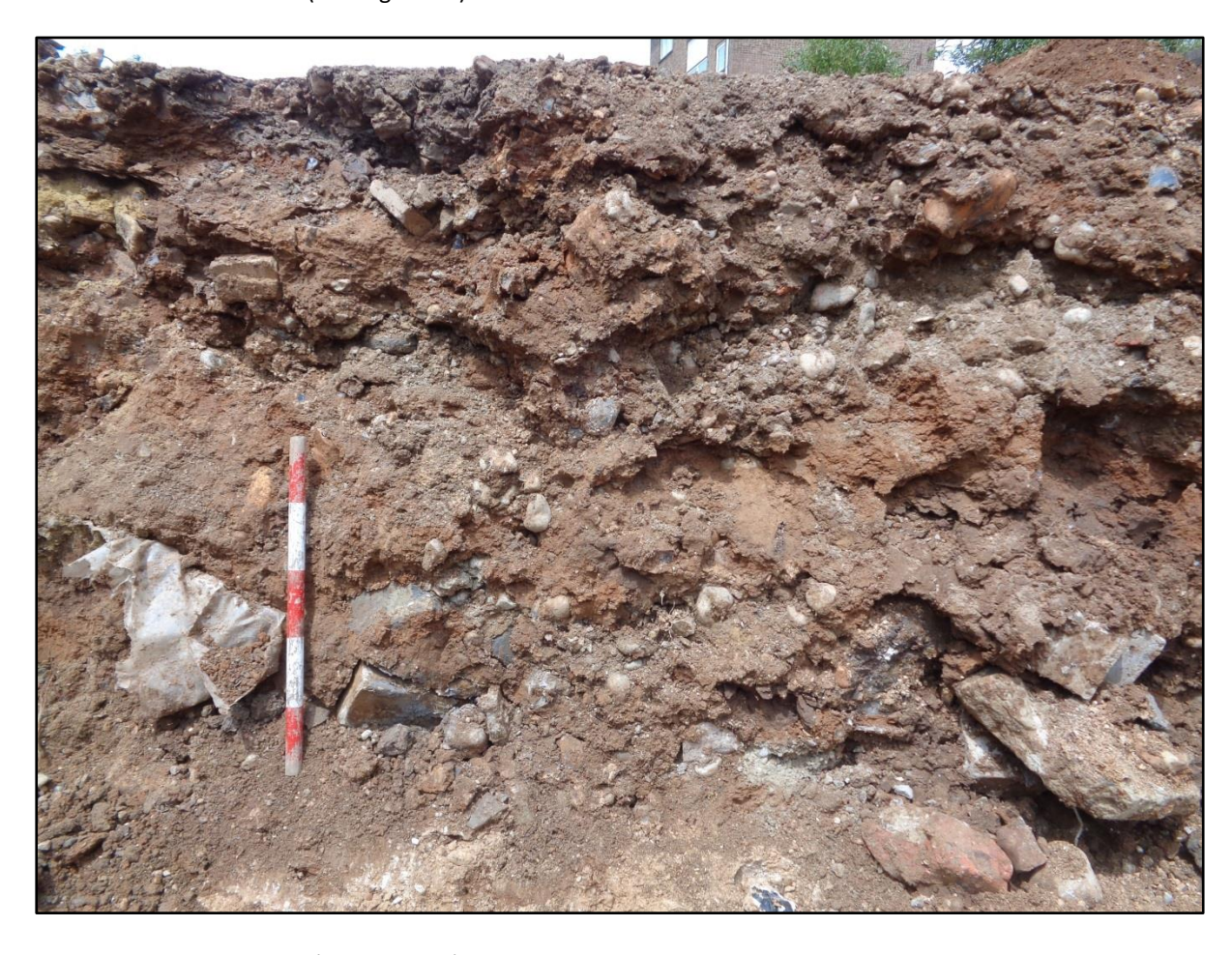
Plate 8. Area 2, Section 11 (Looking East)