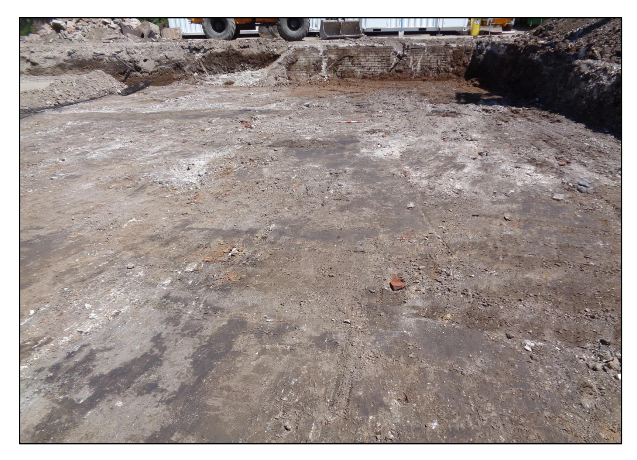
Plate 4. Topsoil/subsoil strip completed at the eastern end of Area 1 with C20th wall to rear (looking N)