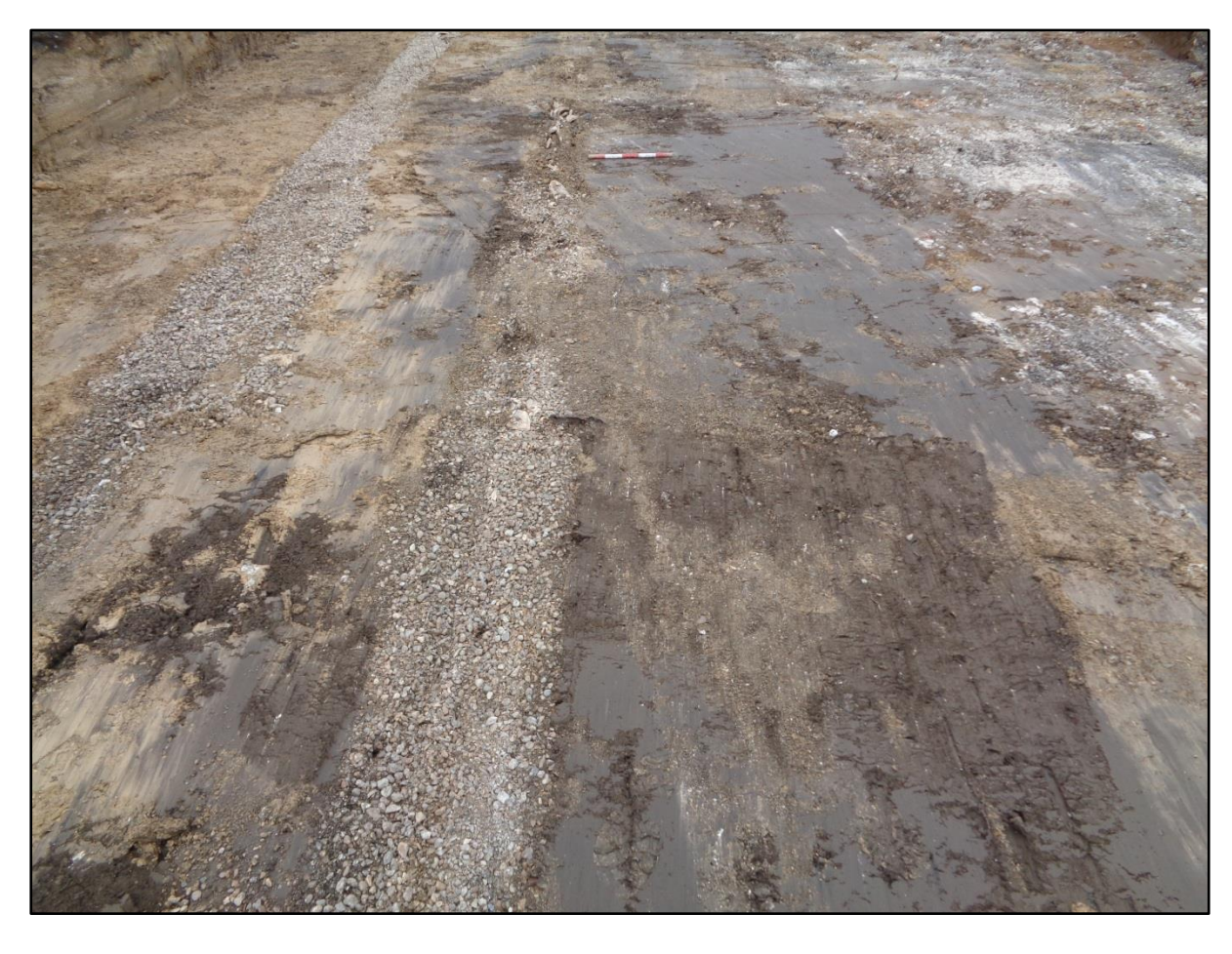
Plate 2. After strip to depth, Area 1 showing severity of disturbance (looking west)