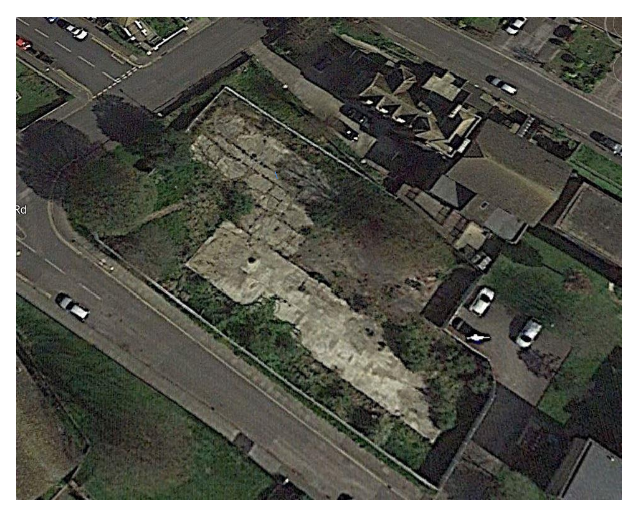
AP 1. View of proposed development area (2017)