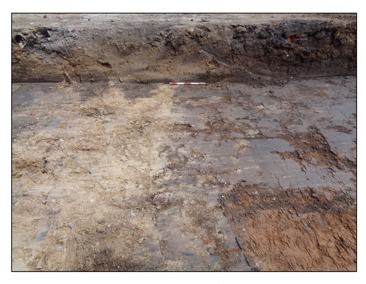
Plate 3. Strip completed, Location of Rep Sec 2 Area 1 (looking south)